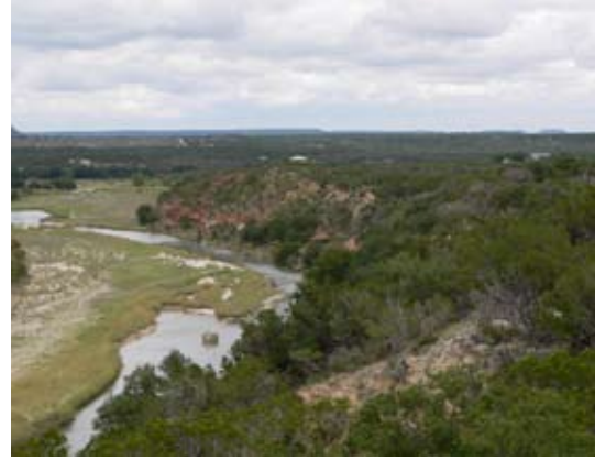
Historic open rangeland in the western Edwards Plateau / Texas Hill Country

Dr. Parker explained that the Edwards Plateau, and especially the western part of the Hill Country, had no natural resources that were easily exploitable in a way that would alter the landscape. For example, the rocky, karst landscape is not attractive as farmland to be cultivated. The region has little to no oil deposits. It has no quantities of minerals to attract large-scale mining activity to alter the landscape. Rather, its greatest value is in the renewable natural resources and as rangeland. Beginning with the Native Americans and continuing with the arrival of the early Spanish inhabitants and the later influx of settlers in the mid- to late 1800's, the people who came to the Hill Country valued this land for its natural resources and as rangeland. Today, the greatest value derived by many ranches and businesses in the region is based on recreation and ecotourism. These sustainable activities are highly dependent upon a high-quality environment including unspoiled vistas.